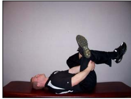
Figure Four Gluteal Stretch – Begin by lying on your back with your right leg crossed over your left knee. With both hands grab behind the left knee and bring the leg back toward your chest. This stretch should be felt in both glutes but a stronger stretch should be felt in that leg which is crossed over. Hold this stretch for 30 seconds and perform it 3 times. Repeat with left leg crossed over right knee.

Soleus (Calf) Stretch – Begin by positioning yourself similar to the gastrocnemius stretch but your back knee will be bent instead of a straight leg. Hold this stretch 30 seconds and repeat 3 times each leg