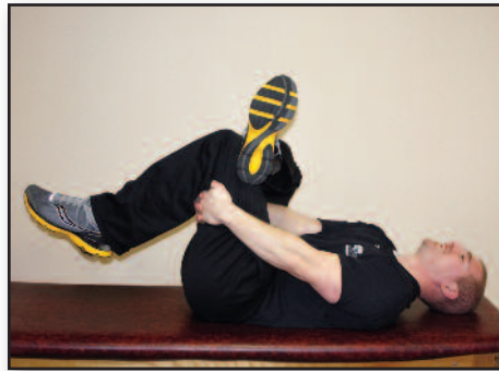
FIGURE FOUR GLUTEAL STRETCH

Begin by lying on your back with your right leg crossed over your left knee. With both hands, grab behind the left knee and bring the leg back toward your chest. This stretch should be felt in both glutes but a stronger stretch should be felt in that leg which is crossed over. Hold for 30 seconds and repeat 3 times. Repeat with left leg crossed over right knee.